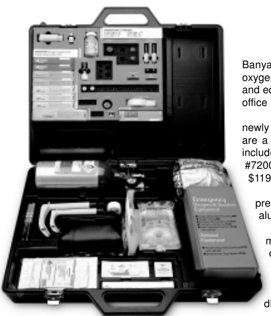
Stat Kit is shown with optional ACLS package